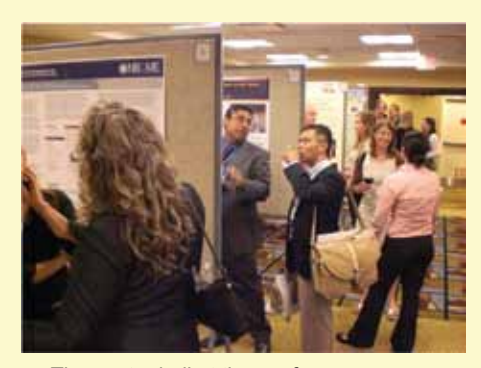
The poster hall at the conference was very busy and well-attended.